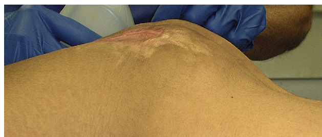
Fig. 2. Clinical photo of Patient 10 demonstrating the condition of the skin in the area of the previous myelomeningocele repair. The skin is often thin and friable, leading to repeated breakdown.

The techniques and instrumentations in the operative treatment of congenital kyphosis have evolved since its surgical origins. In 1968, Sharrard [7] first described