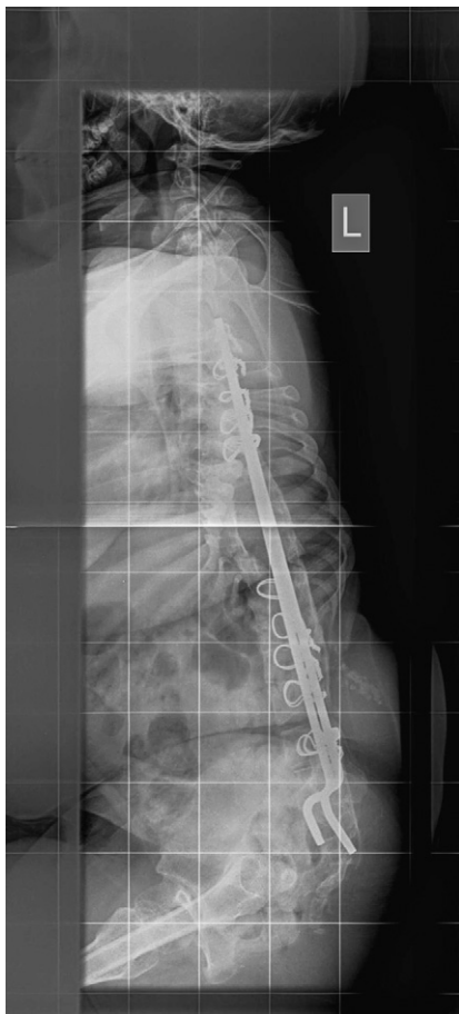
Fig. 3. A postoperative plain lateral radiograph of Patient 8 demonstrating residual thoracic lordosis after apical kyphectomy and instrumentation.

This study reports no major postoperative complications with patients, with the exception of decubitus ulcers. These ulcers occurred at the earliest 1 year postoperatively and were thought to be unrelated to the surgical procedure given the time frame. The skin in the area of the gibbus deformity is friable pre- and postoperatively because of not only tenting of the skin over the bony elements but also secondary to previous procedures for wound closure (Fig. 4).